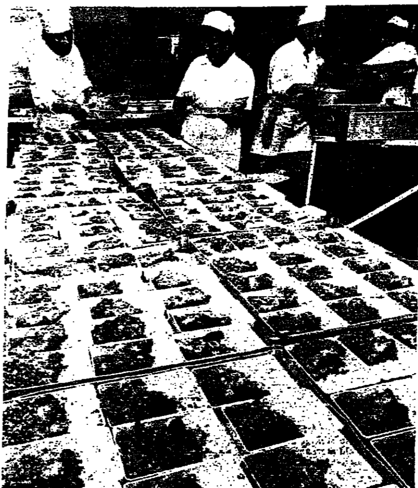
Miles of meals...piping hot dinners for the mass market.